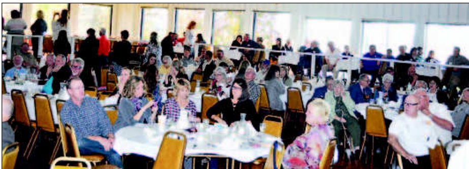
A large group of fair enthusiasts attended the Northern Zone meeting.

Book a new act for your fair – The showcase events at the zone meetings and the trade show at the convention offer lots of new talent and new acts to bring to fairgoers and add excitement to your fairs. Stop by the Talent show and Showcase on Friday and Saturday of the convention to hear some great music.