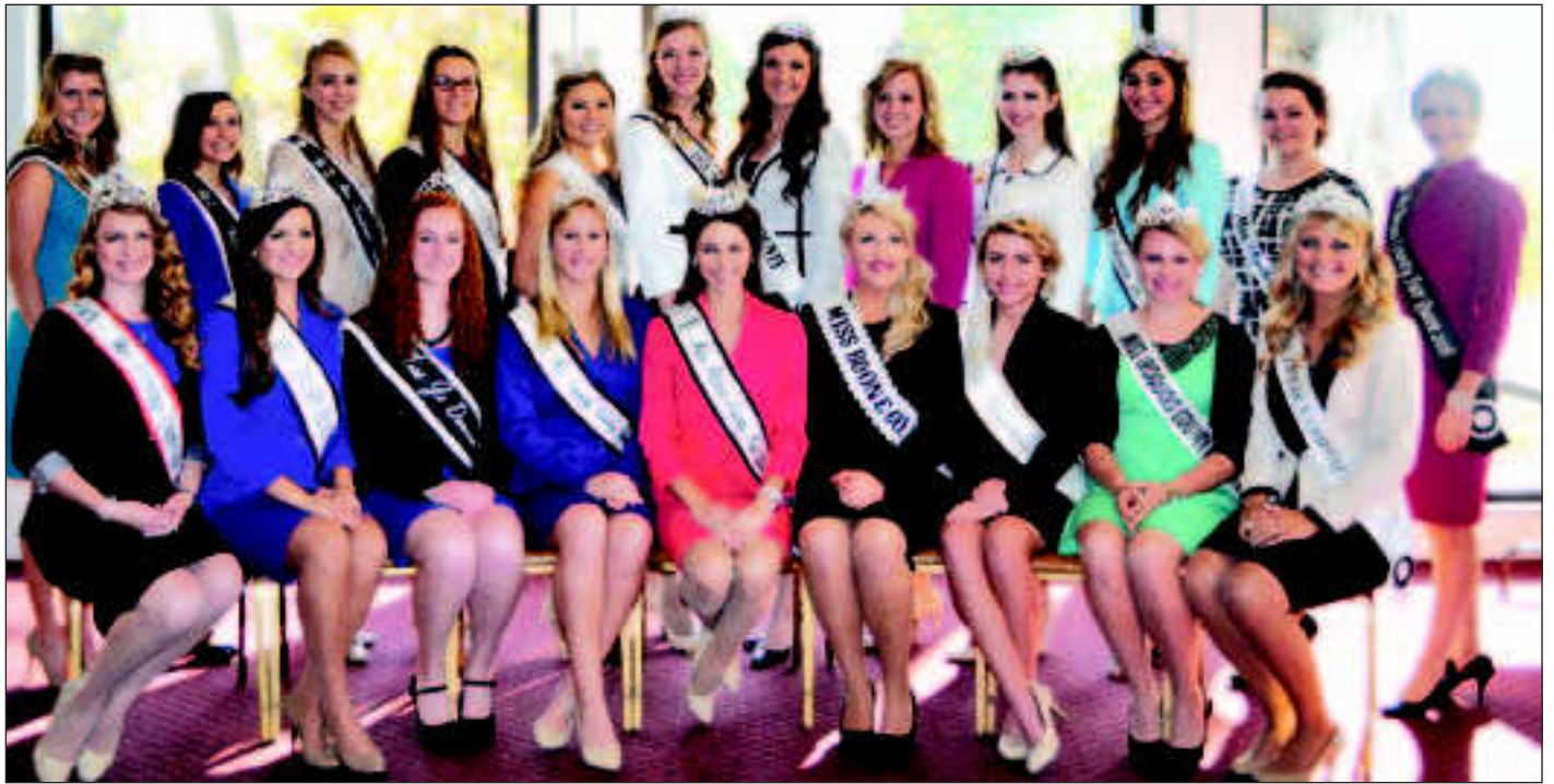
Pictured are 21 queens who attended the Northern Zone meeting who will be competing with 51 other county fair queens in January for the honor of being named Miss Illinois County Fair Queen.