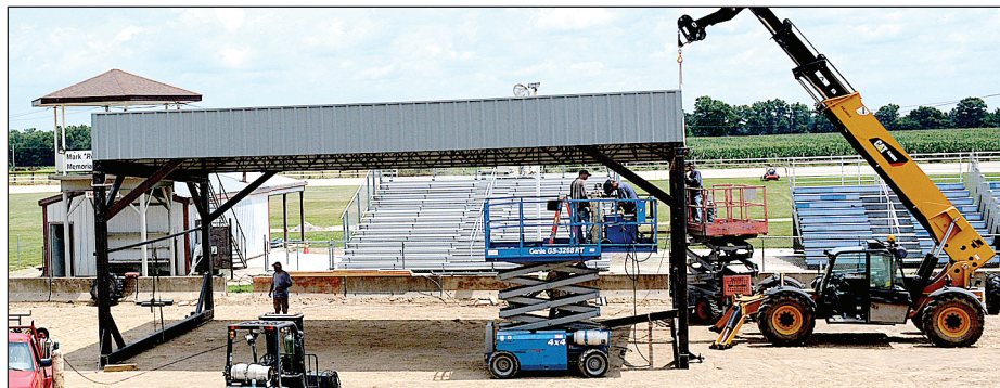
Effingham Clouty Fair has a new stage canopy that was designed and constructed locally and serves a dual purpose.

It is self-propelled by two 1-hp. Electric motors. It moves at a rate of 12 ft. per minutes. They can move