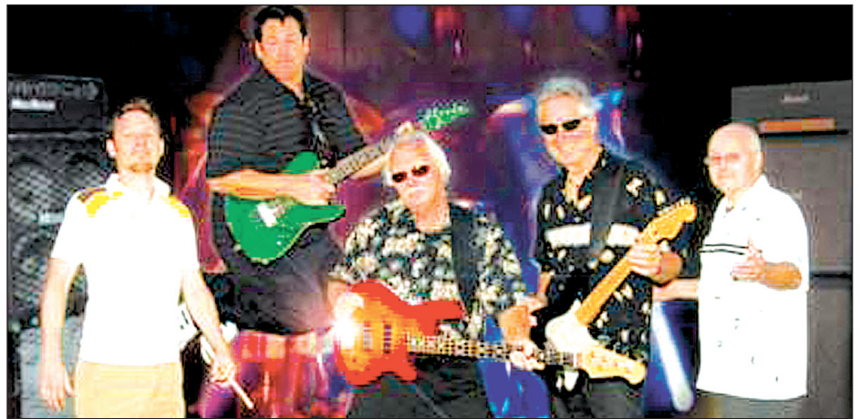
Sojourn Band, represented by Elsenpeter Productions, entertained Central Zone attendees.